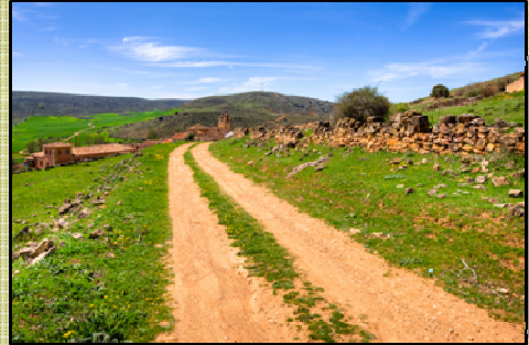
1 st Place – Douglas Haynes