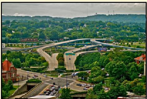
3 rd Place – Bob Fox