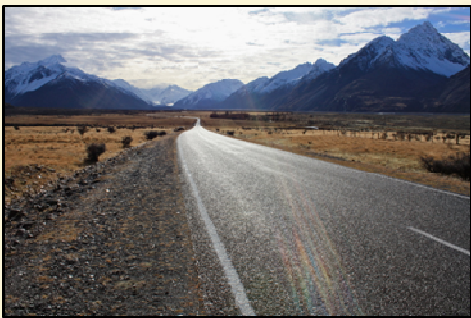
1 st Place – Rod Edmonds