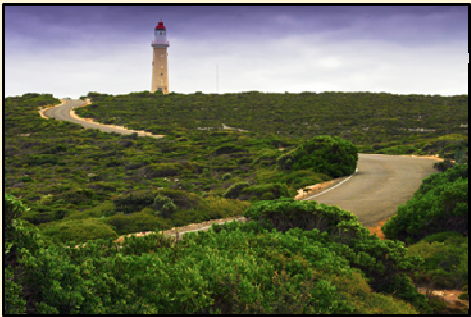
2 nd Place – Dave Clarke