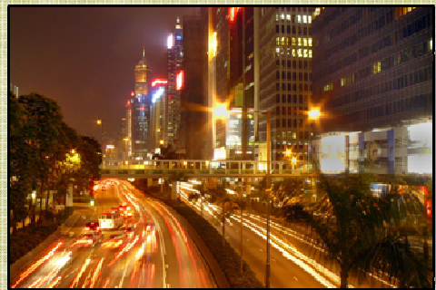
2 nd Place – Todd Fauser